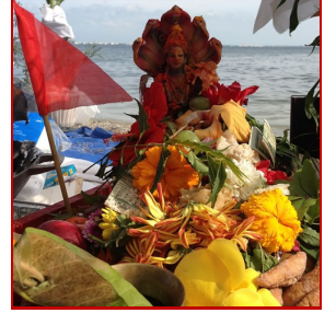
Satyanaarayana & Gangaa Pujaa

Conclusion: Kaartik It is a day of joy, excitement, fun and a unique experience in devotion. It will prove